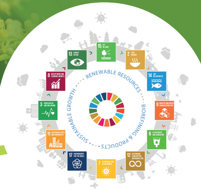
Building a Circular Bioeconomy Bio-Based Industries support the Sustainable Development Goals