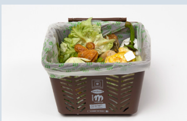
Kitchen caddy delivered in Paris.

Since 2016, an obligation to separately collect bio-waste has applied to large producers generating more than 10 tonnes/year (i.e. more than 30 kg/day, so the entire Horeca sector is covered). The Energy Transition Law of 2015 states that from 2025 all producers, including households, shall implement such collection.